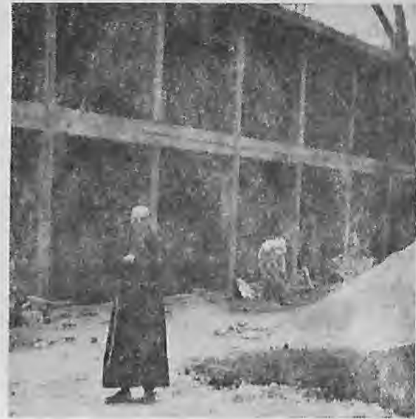
Above: The monastery of the Minim brothers being constructed in 1972 Below: The finished monastery